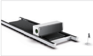
*H series can be either equipped with a basic working table or a high-end working table(including a scrap cart, dust removal, and fan).